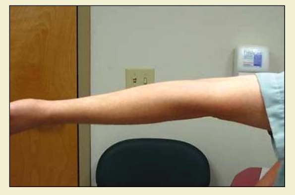
1 Point Each Side —Hyperextension of the elbow beyond 90 degrees (neutral)