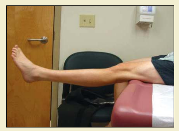
1 Point Each Side —Hyperextension of the knee beyond 90 degrees (neutral)